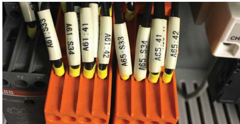
Figure 1: Locate Relays A61 and A65